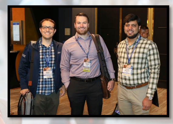
Sponsors too can join as a mentor or mentee, as seen here at the 2023 VIC Summit